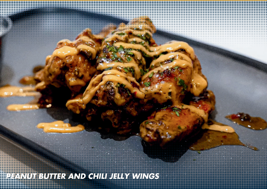
PEANUT BUTTER AND CHILI JELLY WINGS