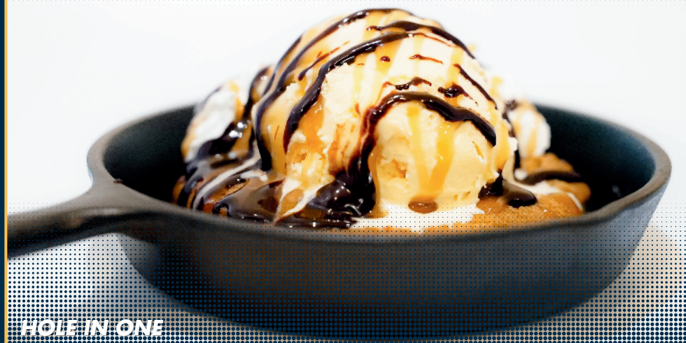
HOLE IN ONE